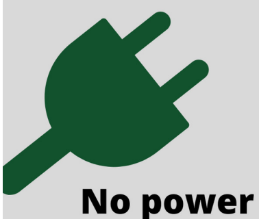
due to PSPS?

PID's crews are busy replacing service lateral lines (those from the PID main lines to homes) throughout the district. Here a crew works on Foster Road.