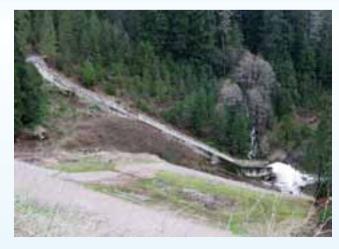
Paradise Dam spillway in Feb. 2017

In the aftermath of the spillway crisis at Oroville Dam, the Department of Water Resources, Division of Safety of Dams (DSOD) is now requiring assessments