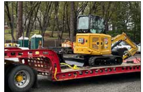
Above: Mini-excavator being delivered to PID's Corp Yard. Below: Boom lift which can be operated by one worker.

equipment but we've always had to rent it. If the equipment wasn't available at the rental facility it caused us to postpone jobs," Hill explains.