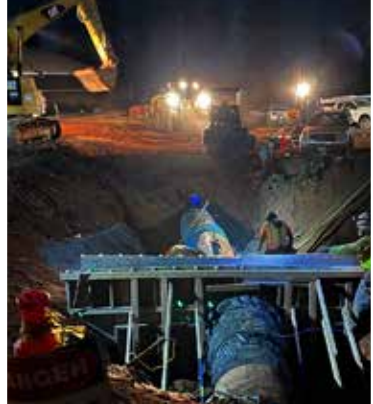
Note the size of the pipe in comparison with the workers.

The tanks will provide 3 million gallons of water storage for our community. This